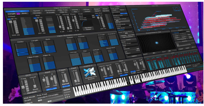
accSone crusher-X 6

accSone developments focuses on software technologies providing sound designers, musicians and video artists with special and unusual tools for their outstanding projects. accSone was founded in 1997 and is located in Munich/Germany. The accSone flagship product crusher-X was born 1999 and raised up to the "most sophisticated" tool for granular synthesis in the market.