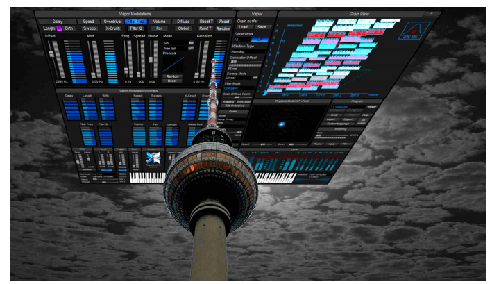
crusher-X 6 arrives at Superbooth 17 in Berlin / Germany (20-22 April 17)